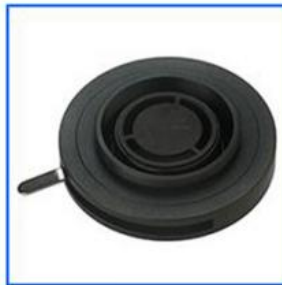
A5D.2611-B Dark Field Ring