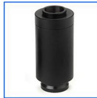
A55.2601-B10 1x C-Mount (Focus Adjustable)