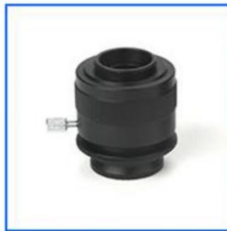
A55.2601-B05 0.5x C-Mount (Focus Adjustable)