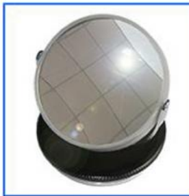
A56.2601-B Plano-concave Mirror