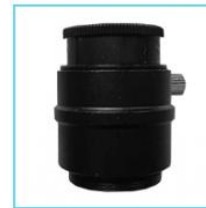
A55.1520-05 0.5x CCD Adapter