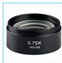
A52.1520-75 0.75X,W.D. 120mm