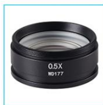
A52.1520-05 0.5X,W.D. 177mm