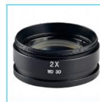
A52.1520-20 2.0X,W.D. 30mm