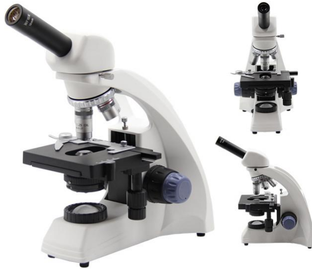
▲ A11.1531-M Monocular Head Biological Microscope

A11.1531-T Trinocular Head Biological Microscope A11.1531-V Teaching Head Biological Microscope