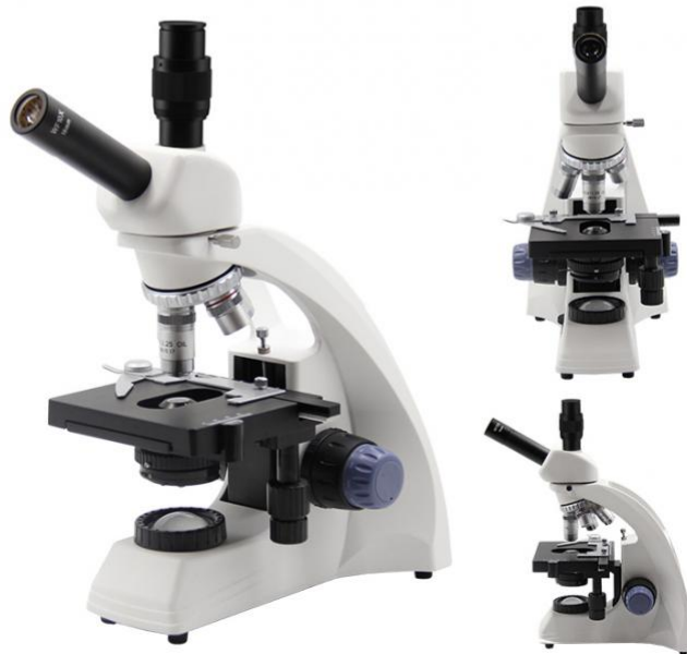
▲ A11.1531-V Teaching Head Biological Microscope