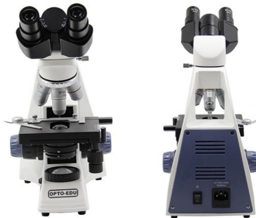
▲ A11.1531-B Binocular Viewing Head Biological Microscope