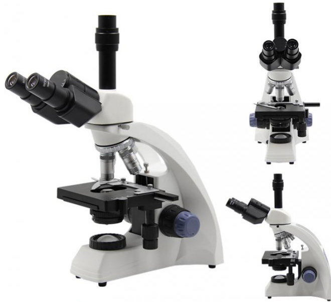
▲ A11.1531-T Trinocular Head Biological Microscope