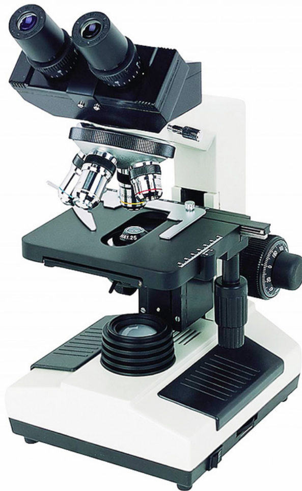
A10.1007-A Dark Field Microscope