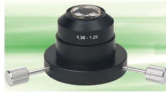
NA 1.2-1.36 For Oil Dark Field Condenser