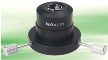
NA 0.7-0.9 For Dry Dark Field Condenser