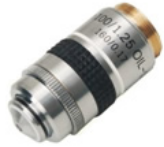
Plan Achromatic 100X with Iris Diaphragm for Oil Dark Field Observation