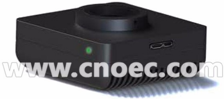
A59.4212 Digital Camera, USB 3.0