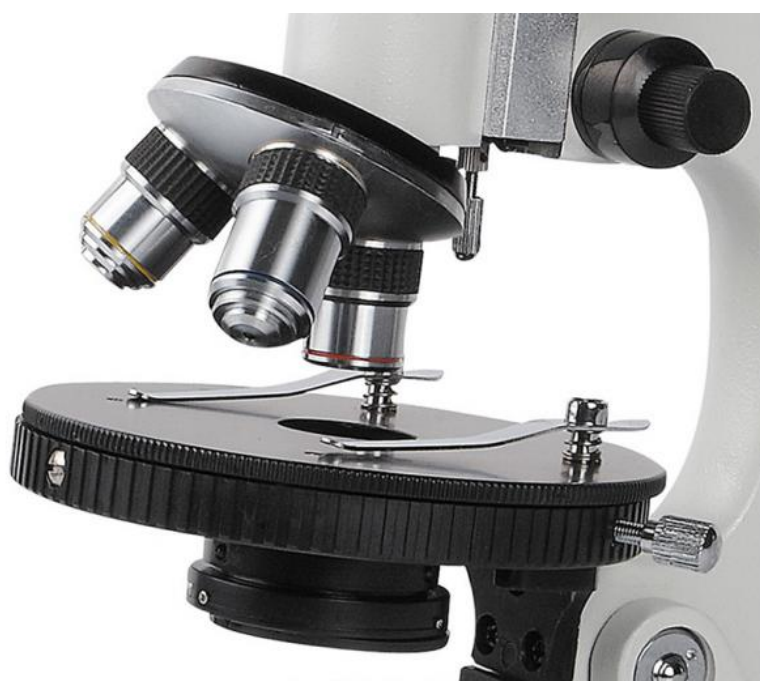
Round Working Stage Dia. 120mm