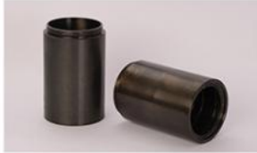
0.4x Auxiliary Lens

It is the main scientific and technical means of national criminal investigation technology, procuratorial technology and forensic identification, and has been widely used in the field of judicial identification technology.