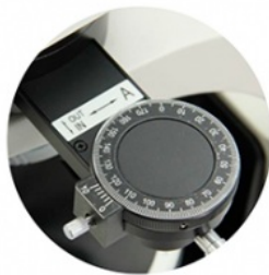
Bertrand Lens, Focus/Center Adjustable Sliding In/Out Optical Path