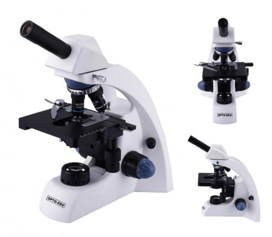
▲ A11.1550-M Monocular Head Biological Microscope

A11.1550-B Binocular Head Biological Microscope A11.1550-T Trinocular Head Biological Microscope