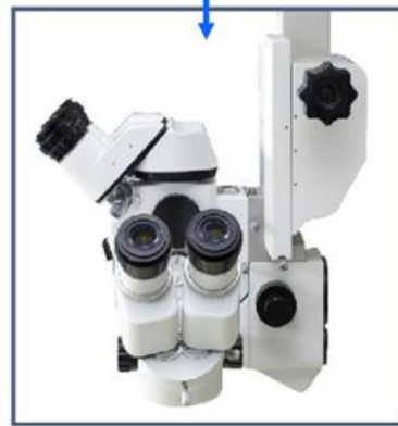
Assistant Head Can Rotate In 90° or 180° Opposite To Main Microscope Head