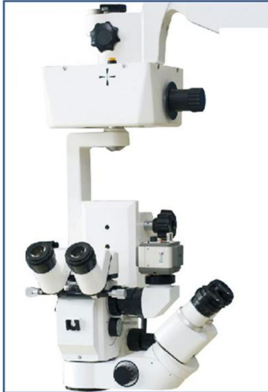
Optional Beam Splitter & CCD Camera Adapter, Can Connect Digital Camera To Output Micro Image For Real Time Sharing & Teaching Work.