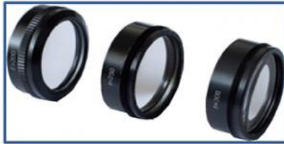
Optional Lens F=200mm, F=250mm, F=300mm, For ENT, Dental or Other Operation Use Too.