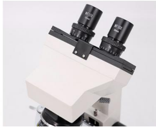
A11.1009-E Binocular Head