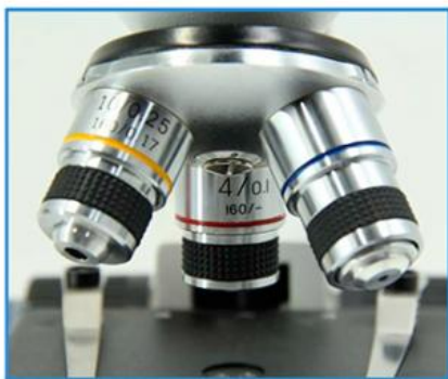
Backward triple revolving nosepiece Achromatic 4x, 10x, 40x