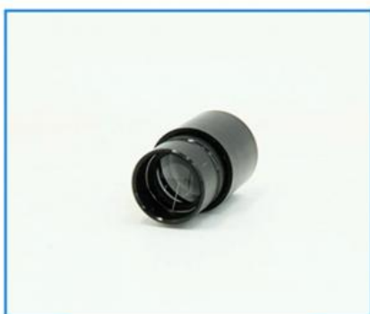
WF10X Eyepiece With Pointer