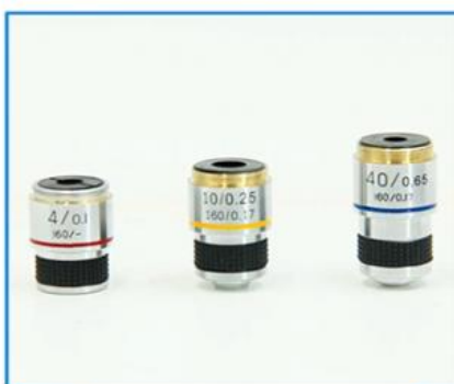
Achromatic Objectives 4x, 10x, 40x