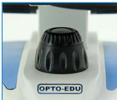
Built-in Bottom LED light, brightness adjustable