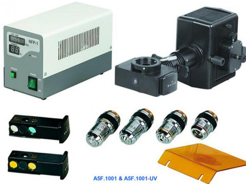
A5F.1001 & A5F.1001-UV