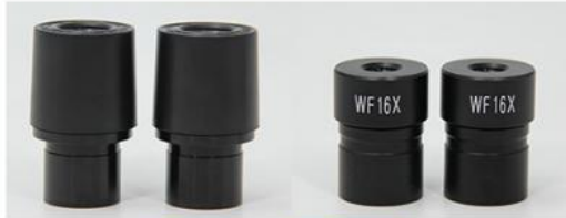
WF10X/18mm & WF16X/11mm