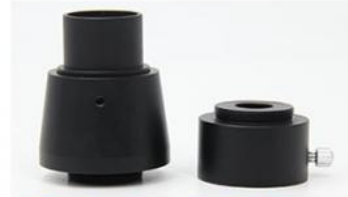
Eyepiece Adapter & 1.0x C-Mount