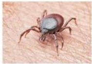
Animal & Plant Epidermis