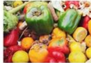
Spoilage Of Fruits & Vegetables