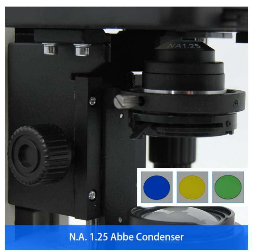
Condenser --N.A. 1.25 Abbe Condenser, Iris Diaphragm, With Filter Holder.

--Double Layer Mechanical Stage, Size 140x140mm, Moving Range 50x75mm Medium-sized Large Working Stage, You Can Place Two Microscope Slides For Easy Observation And Comparison.