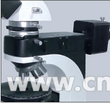
Reflected Light Source