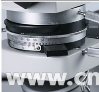
90 degree rotatable Analyzer