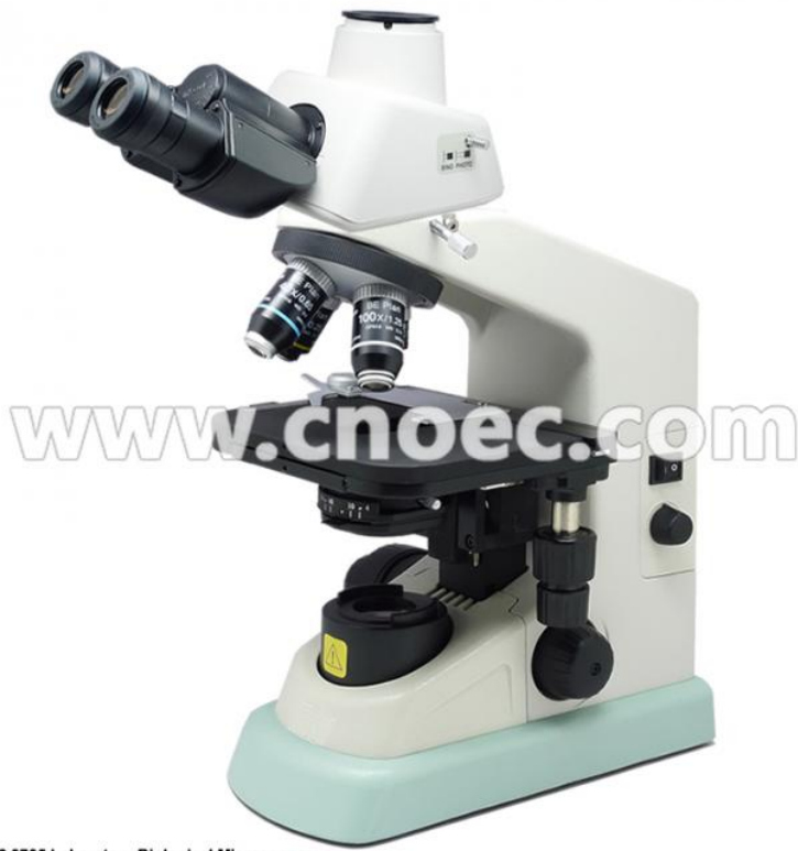
A12.0705 Laboratory Biological Microscope