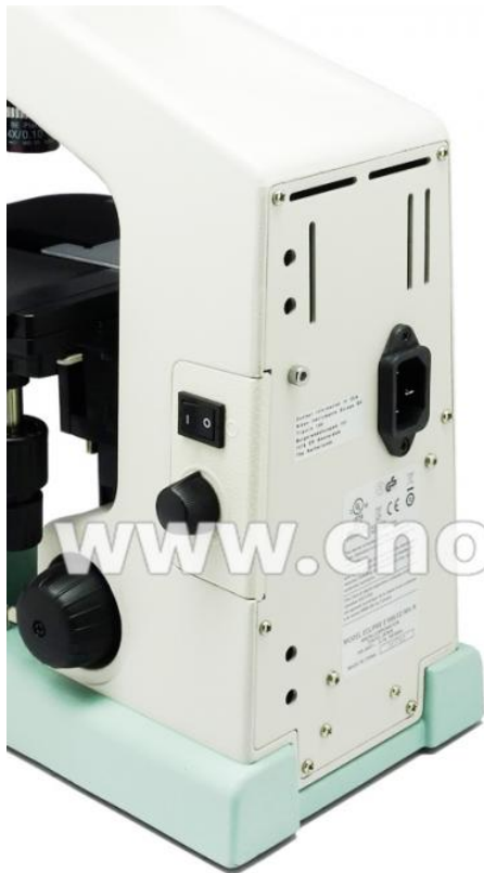
A12.0705 Laboratory Biological Microscope