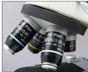
CFI BE Plan Achromatic Objective 4x,10x,40x,100x