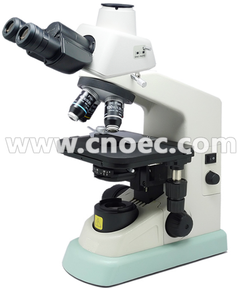
A12.0705 Laboratory Biological Microscope