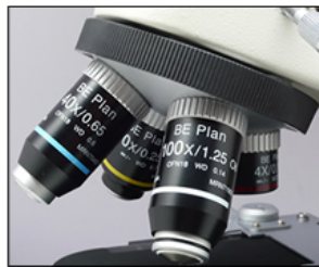
CFI BE Plan Achromatic Objective 4x, 10x, 40x, 100x