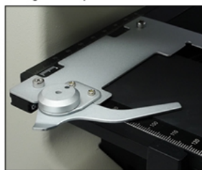
Double Layers Mechanical Stage 155*134mm