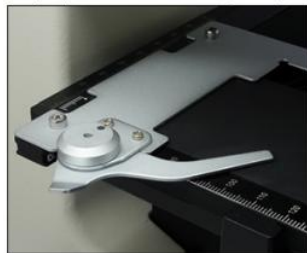
Double Layers Mechanical Stage 155*134mm