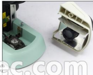
Easy Replacment of 6V/20W Halogen Lamp