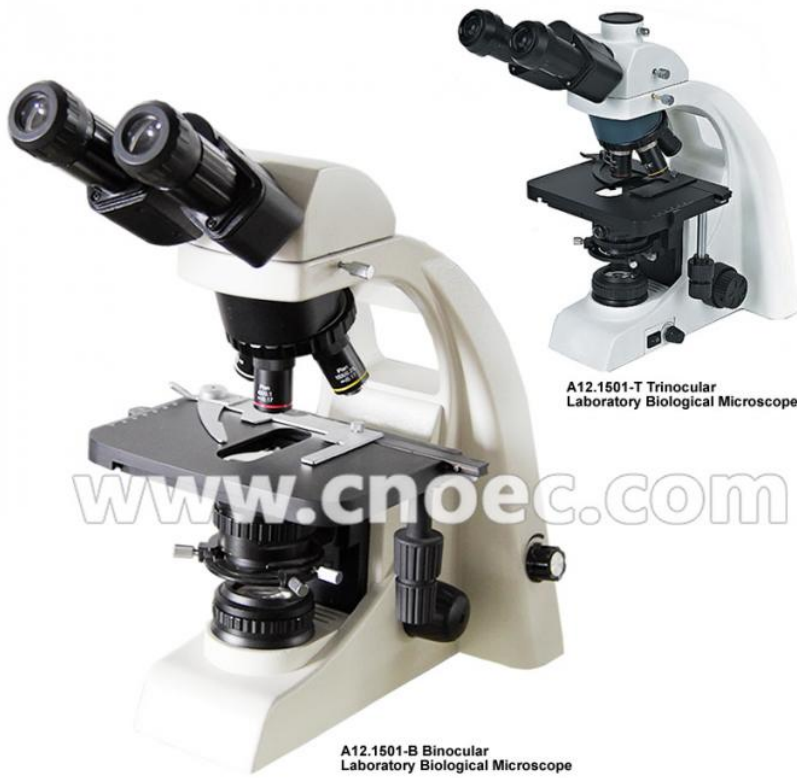
A12.1501-T Trinocular Laboratory Biological Microscope