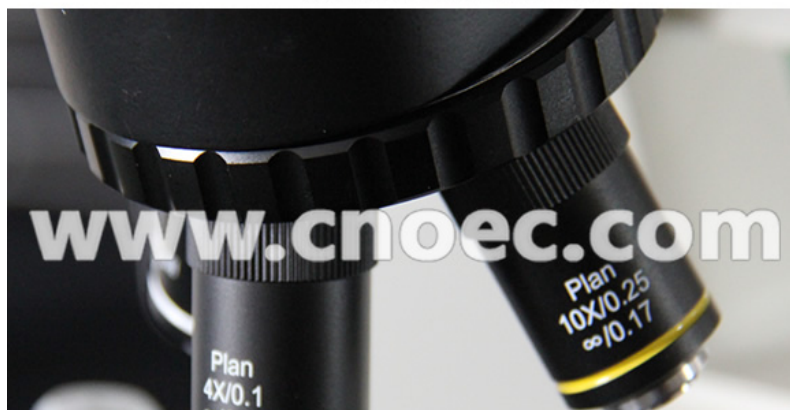
A12.1501-B Binocular Laboratory Biological Microscope