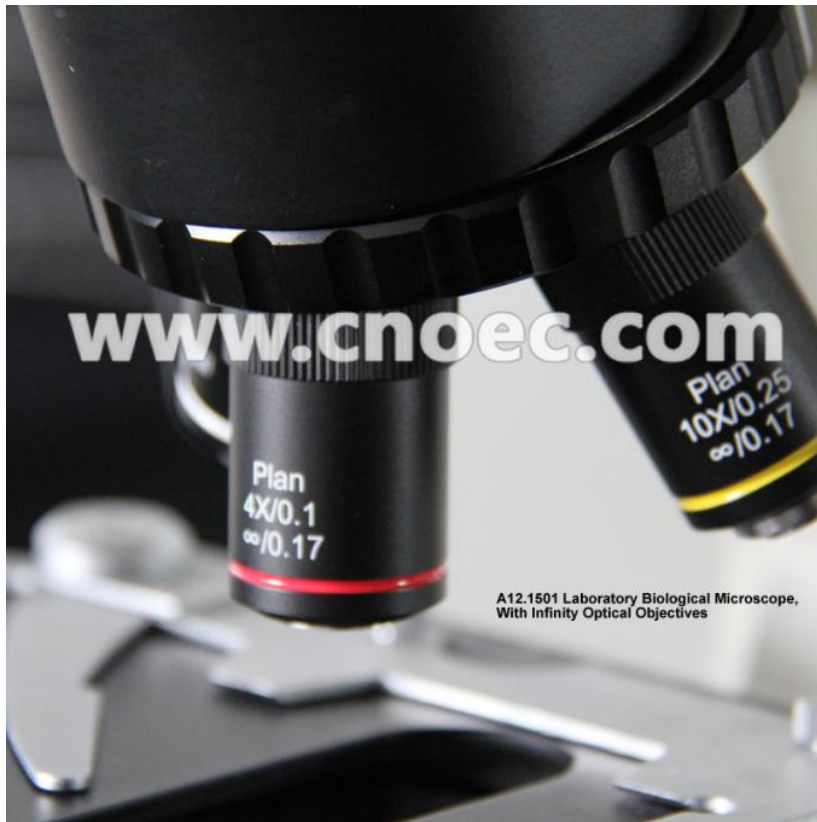
A12.1501 Laboratory Biological Microscope, With Infinity Optical Objectives