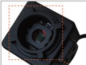
Standard C-Mount With Simple Installation Design, It Can Be Used in Trinocular Photo Tube With C-Mount Of All Kinds Biological Microscopes Or Stereo Microscopes