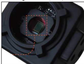
A59.4904 Digital Camera, 5.0M, USB2.0

5.0M High Resolution CMOS Sensor Adopt The New CMOS Ture 5.0M Sensor, It Greatly Reduce Image Noise.