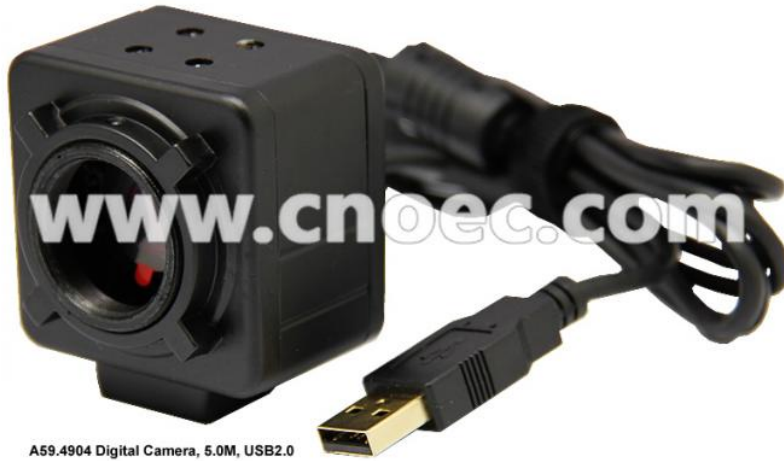
A59.4904 Digital Camera, 5.0M, USB2.0