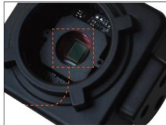
5.0M High Resolution CMOS Sensor Adopt The New CMOS Ture 5.0M Sensor, It Greatly Reduce Image Noise.