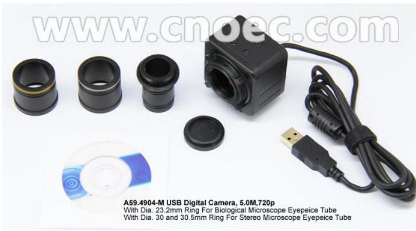
A59.4904-M USB Digital Camera, 5.0M, 720p With Dia. 23.2mm Ring For Biological Microscope Eyepeice Tube With Dia. 30 and 30.5mm Ring For Stereo Microscope Eyepeice Tube