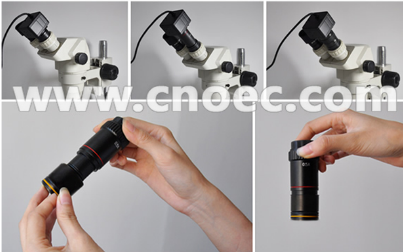
0.5X And 1.0X Lens Are Equipped With Rubber Ring To Make The Adapter Ring Very Stable Avoid Detachment Troubles