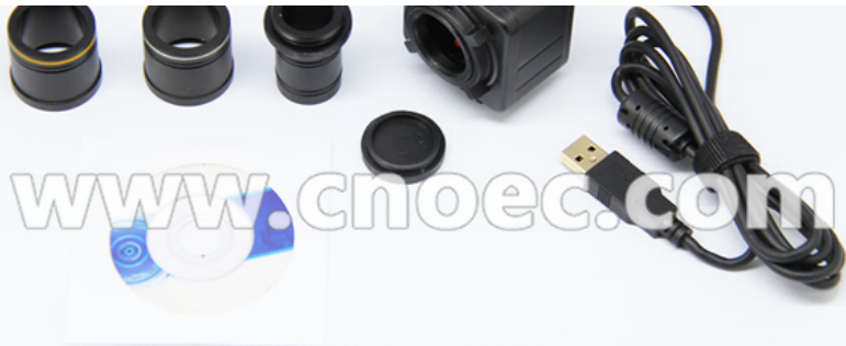
A59.4904-M USB Digital Camera, 5.0M,720p With Dia. 23.2mm Ring For Biological Microscope Eyepeice Tube With Dia. 30 and 30.5mm Ring For Stereo Microscope Eyepeice Tube