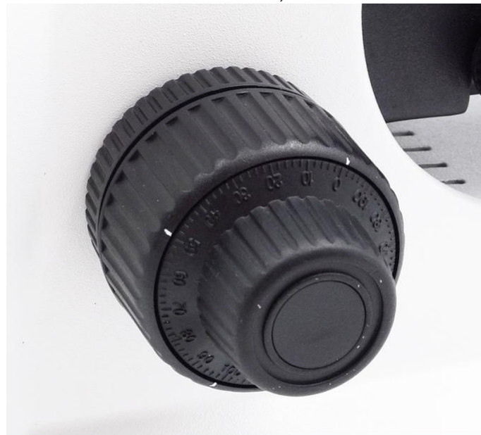
Coaxial Coarse & Fine Focusing

Abbe Condenser N.A.1.25, Iris Diaphragm, Rack & Pinion Up/Down, With Filter Holder 3W-LED Illumination Systems