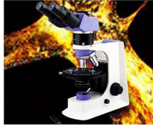
A15.2603 Polarizing Microscope(Transmit)