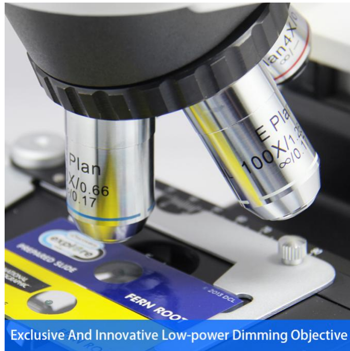
Exclusive And Innovative Low-power Dimming Objective