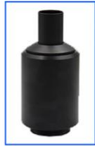
A55.2610 Digital Eyepiece Camera Adapter