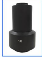
A55.2601-10 C-Mount 1.0x, Focus Adjustable