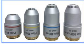
A51.2603 Plan Objective