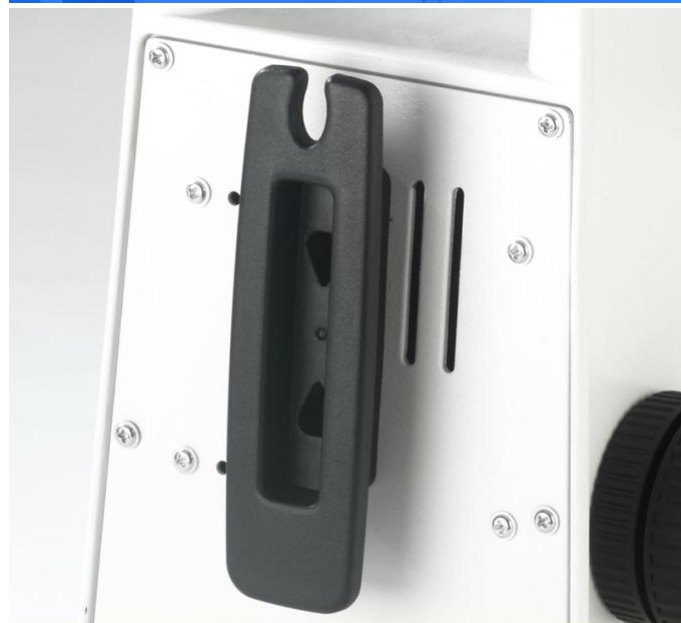
Wire Winding Device