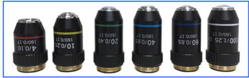
A52.2601 Achromatic Objective