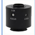
A55.2601-05 C-Mount 0.5x, Focus Adjustable