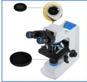
A5P.2601-S Analyzer + Polarizer Set