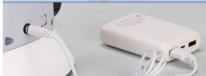
Powered By Safety Low Voltage Charger, Input Wide Voltage 100V-240V, Output 5V1A, Support Power Bank Supply For Outdoor Use