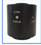
A55.2601-75 C-Mount 0.75x, Focus Adjustable