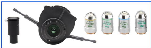
A5C.2603-S Turret Phase Contrast Attachment