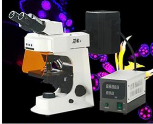
A16.2601 Fluorescence Microscope