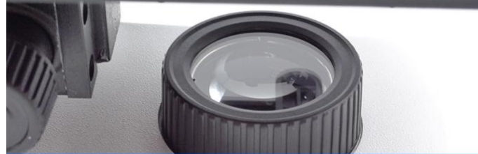
3W-LED Illumination Systems