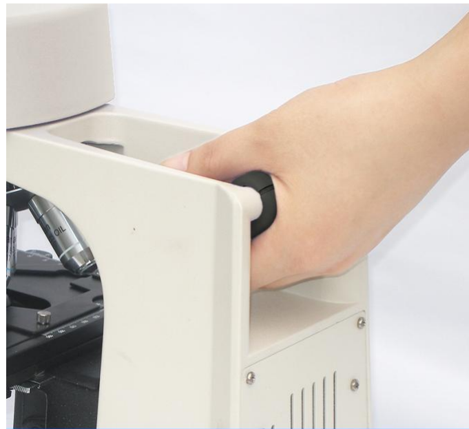
Holding Hole On Back