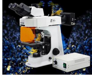
A16.2601-L LED Fluorescence Microscope