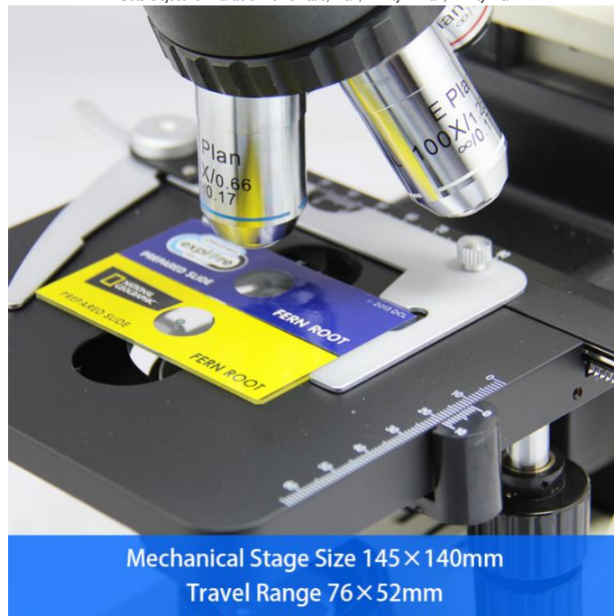
Mechanical Stage Size 145 x 140mm Travel Range 76 x 52mm

4 Sets Objective Available: Achromatic, Plan, Infinity E-Plan, Infinity Plan.