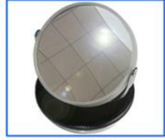
A56.2601 Reflecting Mirror & Holder