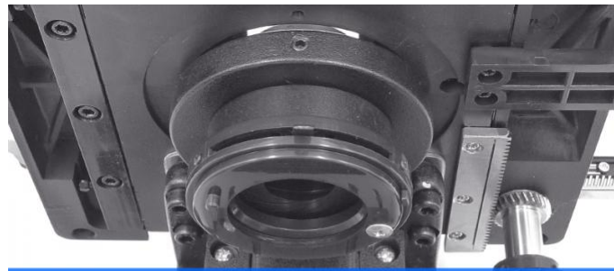
Abbe Condenser N.A.1.25, Iris Diaphragm, Rack & Pinion Up/Down