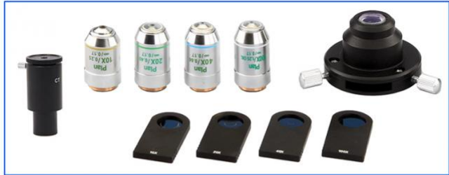
A5C.2601 Phase Contrast Objective + Side + Condenser + Telescope + Green Filter