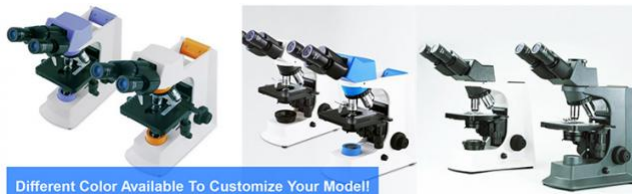
Different Color Available To Customize Your Model!