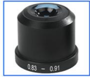
A5D.2610-S Dark Field Condenser, Dry