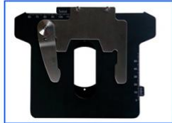
A54.2601-S12 Rackless (Integrated) Stage