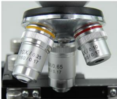
Achromatic 4x, 10x, 40x(s)