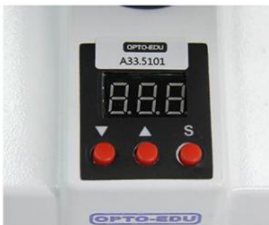
Temperature Control And Display Screen To Ensure The Activity Of The Observed Sample And Make The Observation Result More Accurate