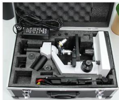
Aluminum Box + Strong Master Carton