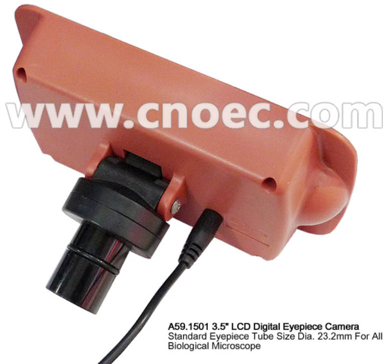
A59.1501 3.5" LCD Digital Camera SD Card Slot USB 2.0 Output AV Output