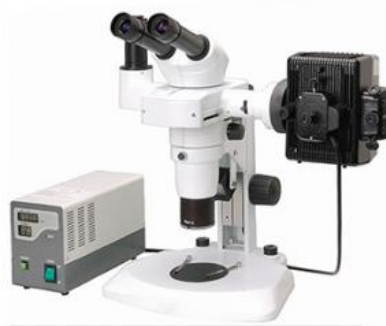
A23.1001-F Flourescent Zoom Stereo Microscope