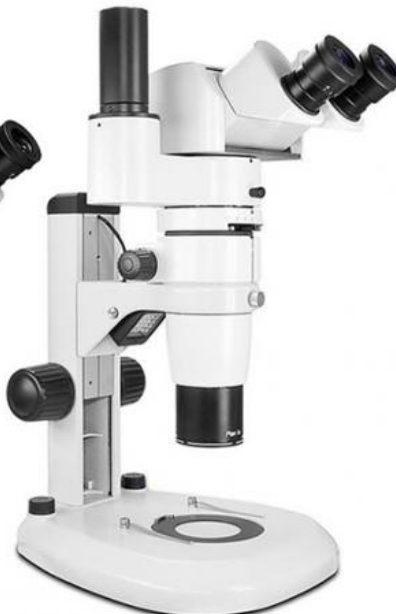
A23.1001-T Standard Set with A55.1003-S1 Photo Tube, Beam Splitter 1 Port