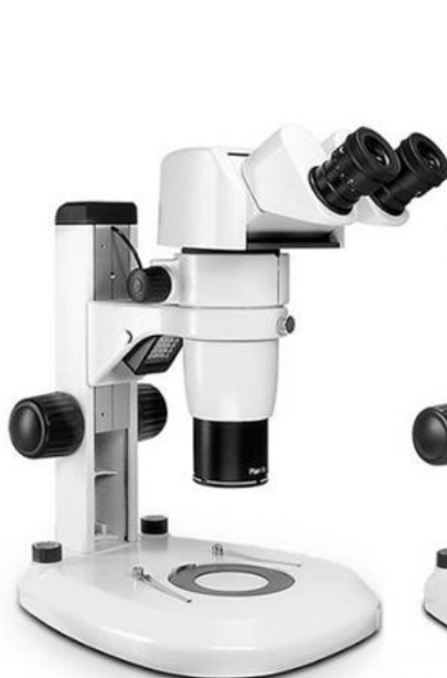
A23.1001-T Standard Set