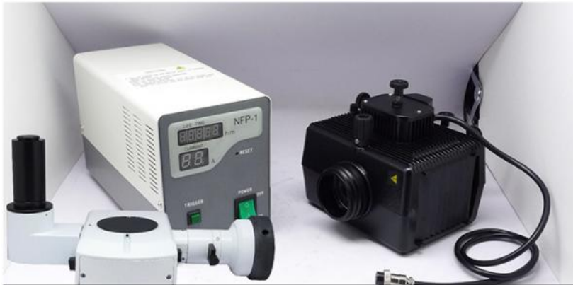
A5F.1020 EPI-Fluorescent Attachment For Stereo Microscope