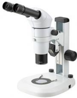
A23.1001 Zoom Stereo Microscope, Max 0.8~8x