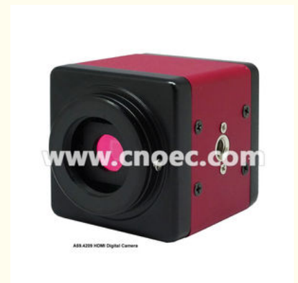
A59.4209 HDMI Digital Camera

for more products please visit us on cnoec.com