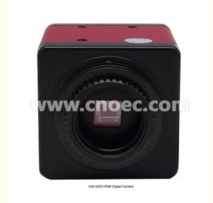
A59.4209 HDMI Digital Camera