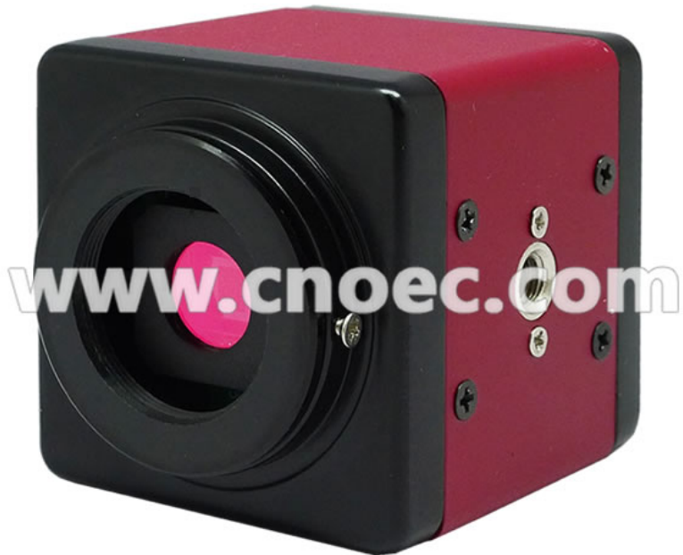
A59.4209 HDMI Digital Camera