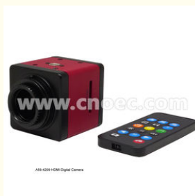
A59.4209 HDMI Digital Camera