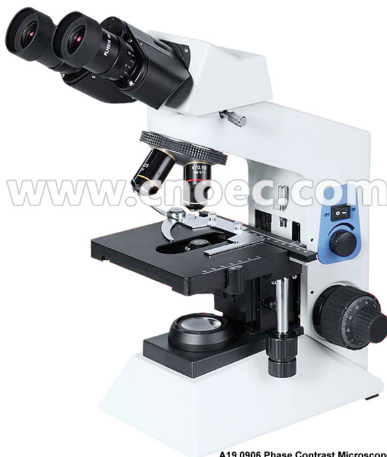
A19.0906 Phase Contrast Microscope