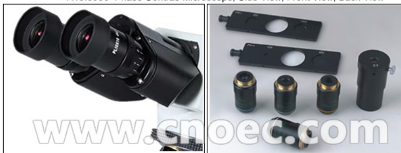
Binocular Head, Diopter Adjustable