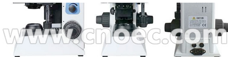
A19.0906 Phase Contrast Microscope, Side View, Front View, Back View