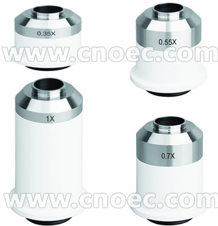
A59.2207 C-Mount, Nikon Series