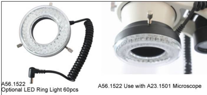
A56.1522 Optional LED Ring Light 60pcs