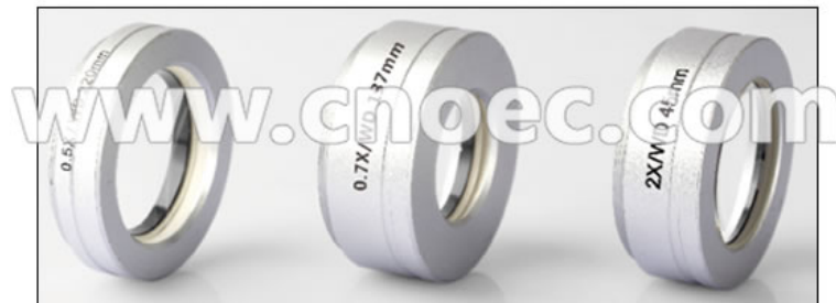
Auxiliary Objectives: 0.5x/220mm; 0.7x/137mm; 2x/45mm