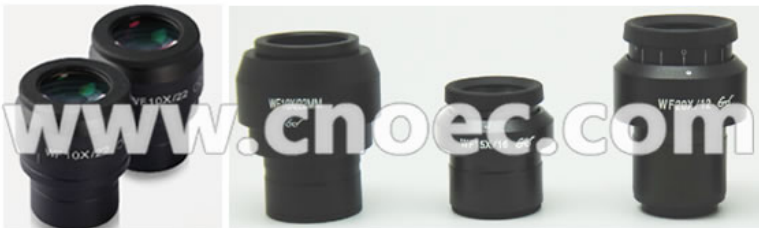
Standard Eyepiece WF10x/22