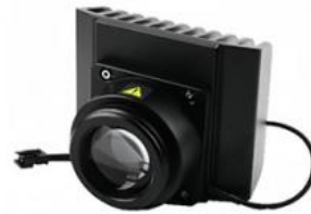
Ultra High Power and Wide Spectral White LED Light Source