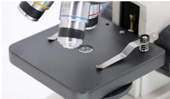
Plain Stage with Slide Clip