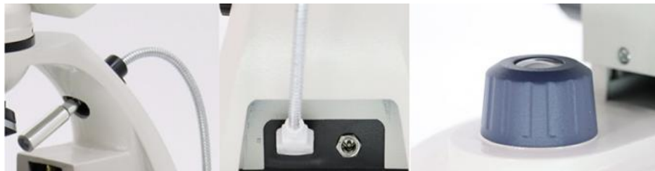
Upper Flexible LED, Bottom LED Brightness Adjustable