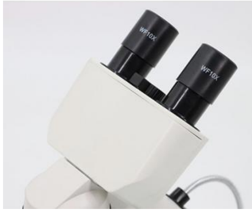
A11.1020-B Binocular Head