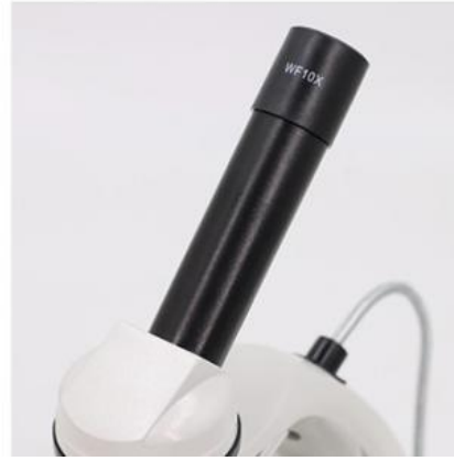
A11.1020-M Monocular Head