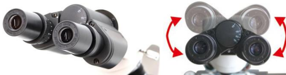
Interpupillary Distance 180° Adjustable