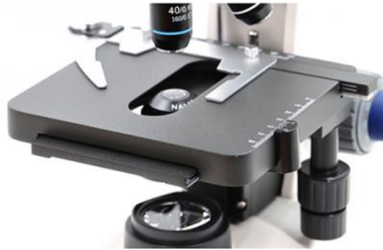
Double Layers Mechanical Stage