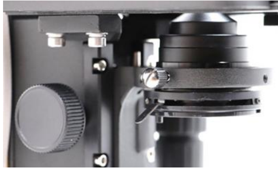
Abbe Condenser N.A.1.25