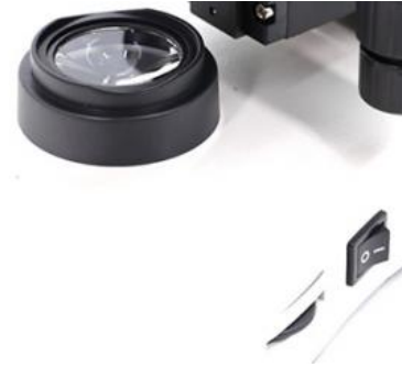
LED 3W, Brightness Adjustable