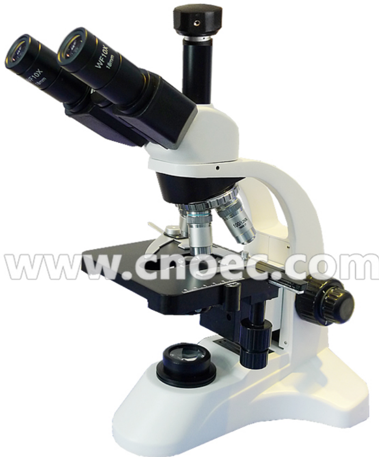
A31.1535 Digital Biological Microscope, 5.0M