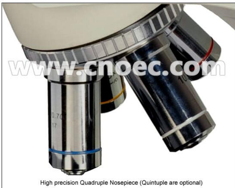
High precision Quadruple Nosepiece (Quintuple are optional)