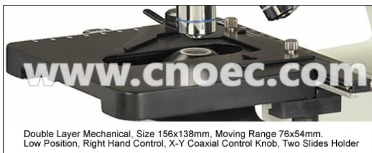
Double Layer Mechanical, Size 156x138mm, Moving Range 76x54mm. Low Position, Right Hand Control, X-Y Coaxial Control Knob, Two Slides Holder