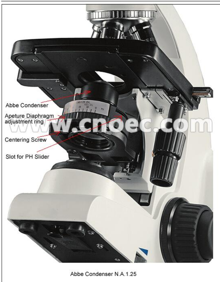
Abbe Condenser N.A. 1.25