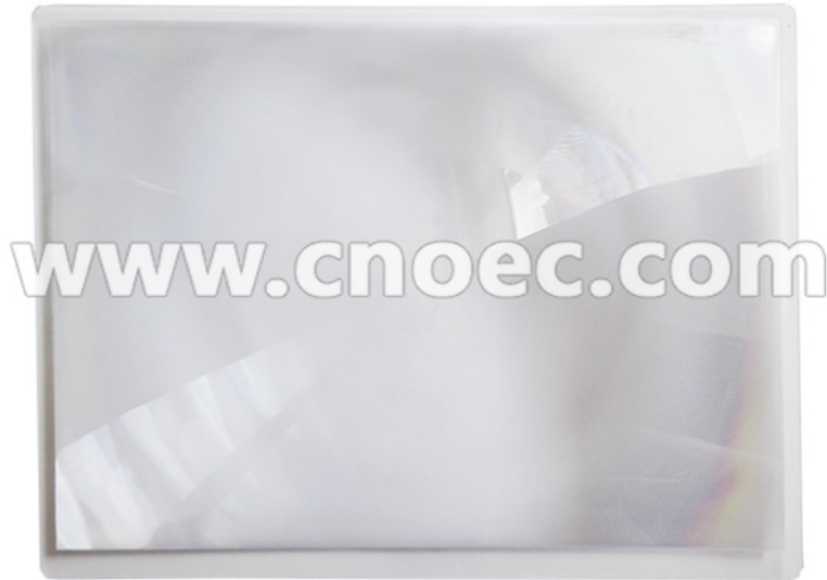
G11.4520 Fresnel Lens Sheets Magnifier