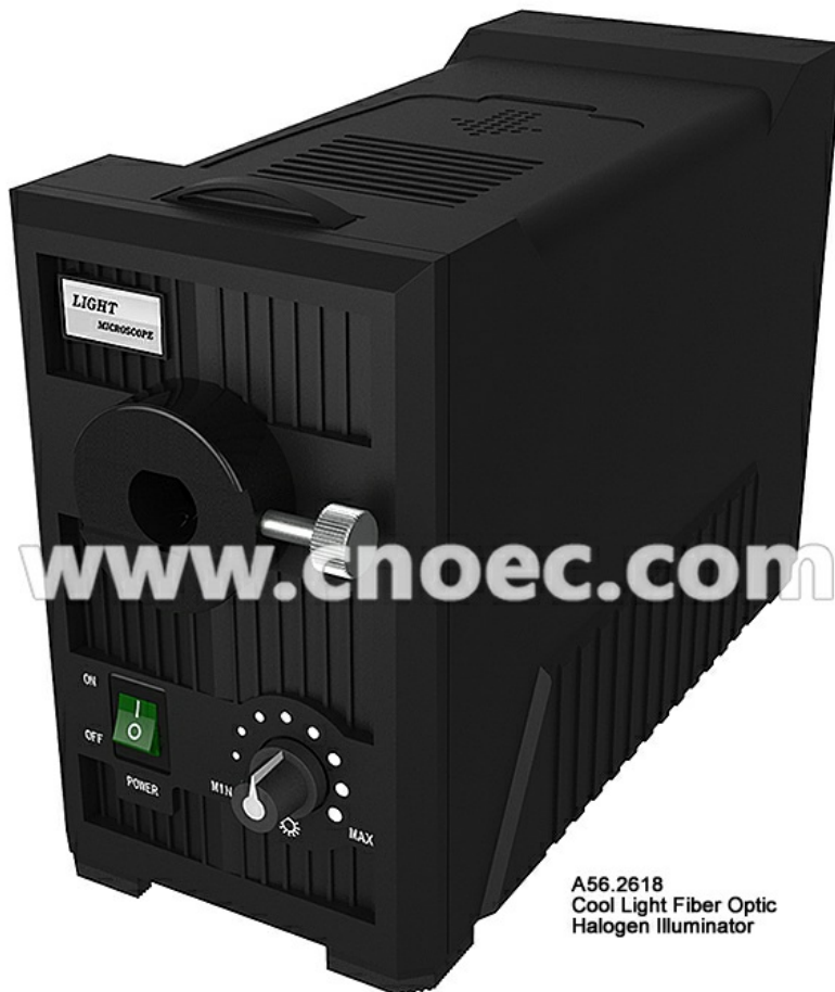
A56.2618 Cool Light Fiber Optic Halogen Illuminator